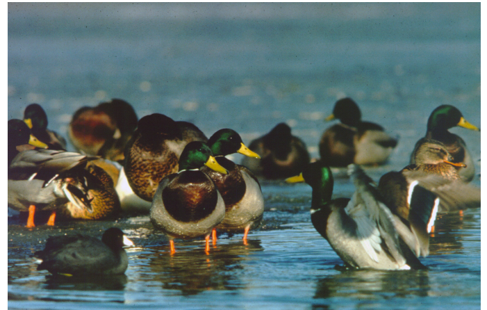
Mallard ducks ( Anas platyrhynchos ).