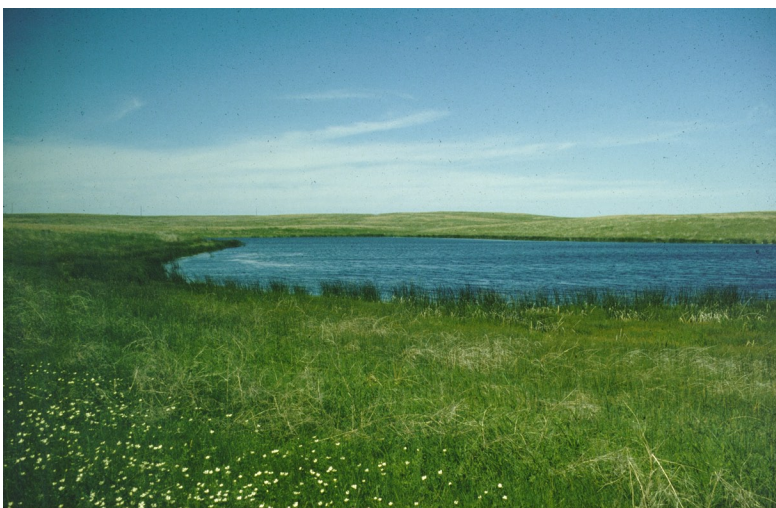
Prairie wetland in north-central South Dakota

Climatologists forecast increased drought in the PPR under most climate scenarios. Air temperatures in northern and central parts of the PPR may warm 3-6°C by the end of this century. Longer growing seasons, milder winters, earlier springs, and warmer and drier summers are expected.